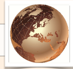
Foreign Direct Investment Stock Flows - 1980 & 2009